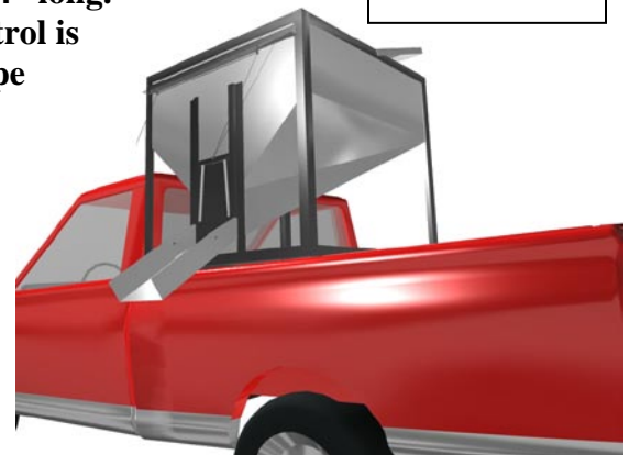
Model # 2

Model No. 1 has non-clog offset chute with a full six-inch adjustment which allows placement of feed into tire track. Model No. 2 has a non-clog straight chute that is 10” wide x 24” long. Fines Box collects all cake other than range size. Remote Control is achieved through use of sturdy lever arm and heavy nylon rope through positive action pulleys.