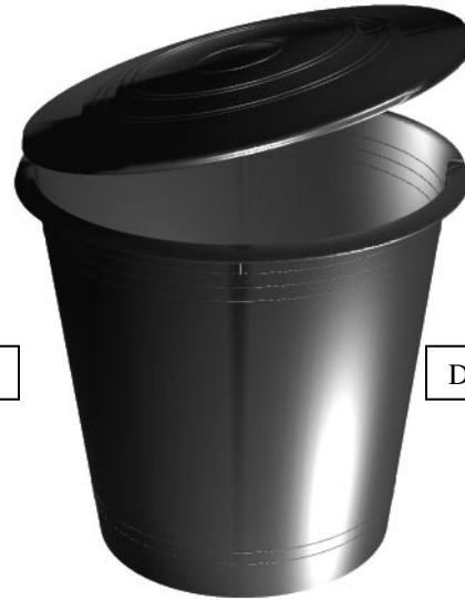
DRUM WITH LID