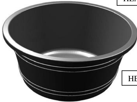
HEAVY DUTY ROUND TANK